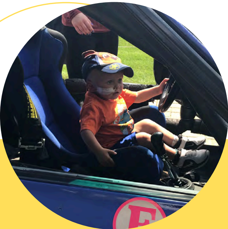
Photo from New England Region SCCA Race Against Leukemia in 2019