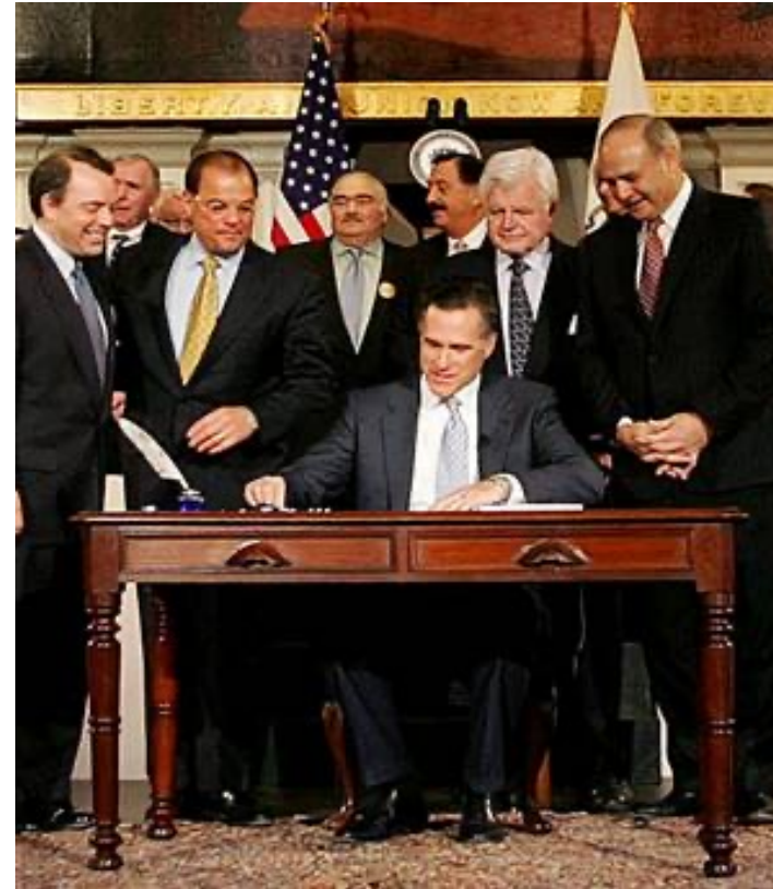
Gov. Romney Signing Chapter 58